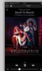
iPhone Now playing screen