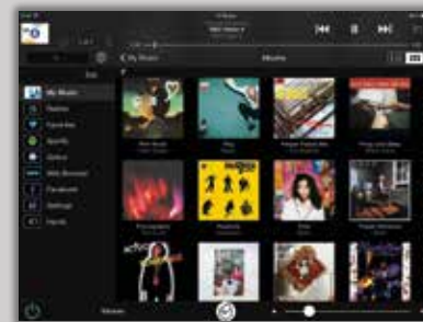
iPad Navigation screen