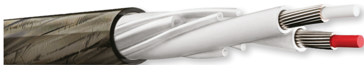
ABOVE: Inside the Supremus Zr showing the 16 silver-plated 5N copper strands per conductor, each wrapped around a LDPE cylinder (white and red) and sheathed in a similar polyethylene